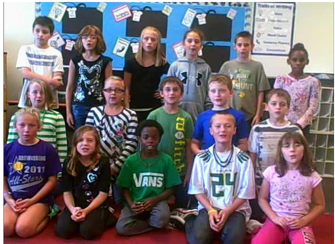
The Talent — Fourth graders at Reagan Elementary (Brownsburg, IN)